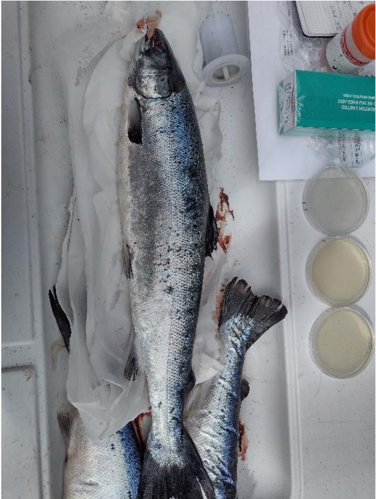
Figure 1. External View