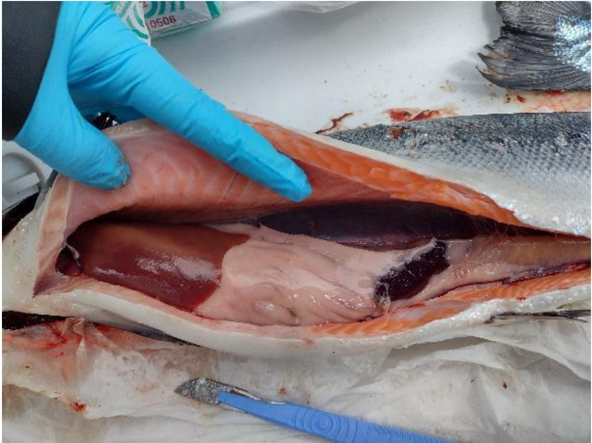
Figure 2. Internal view.